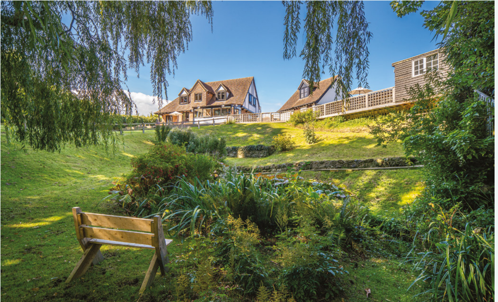
Hungerberry House, 12 Hungerberry Close, Shanklin, Isle of Wight