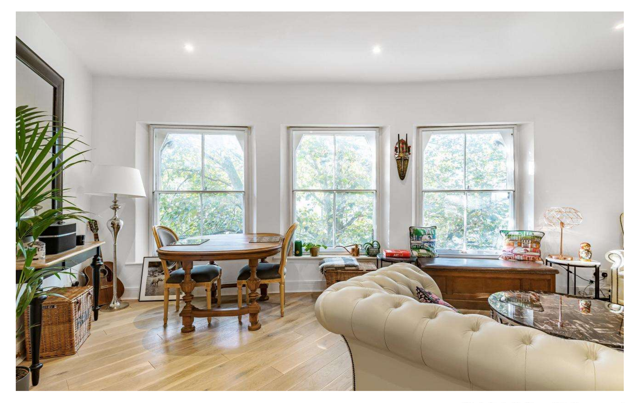
Farringdon Road, Clerkenwell, EC1R