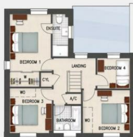
FIRST FLOOR PLOTS: 8 & 15