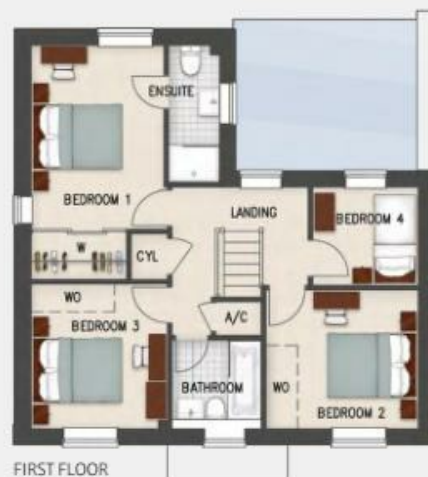
FIRST FLOOR PLOTS: 8 & 15