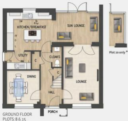
GROUND FLOOR PLOTS: 8 & 15