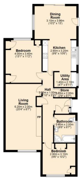
14 SHEARWATER CRESCENT, Barrow