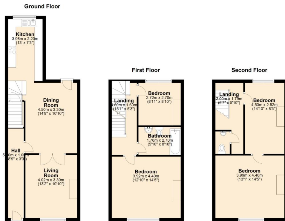
9 paradise street, Barrow