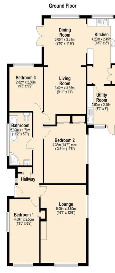
17 SKIDDAW GARDENS, Barrow