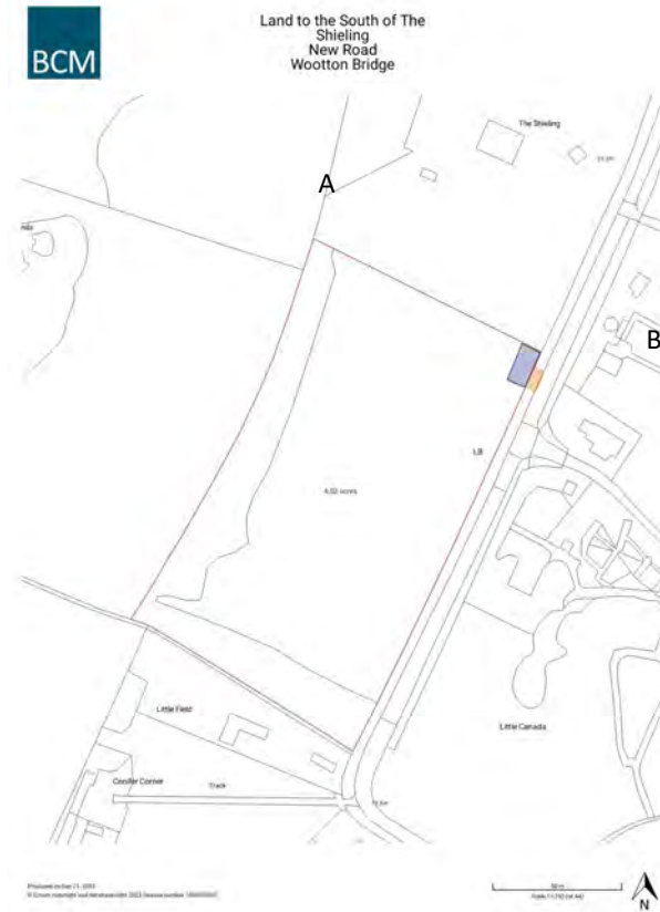
PROPOSED TRANSFER PLAN