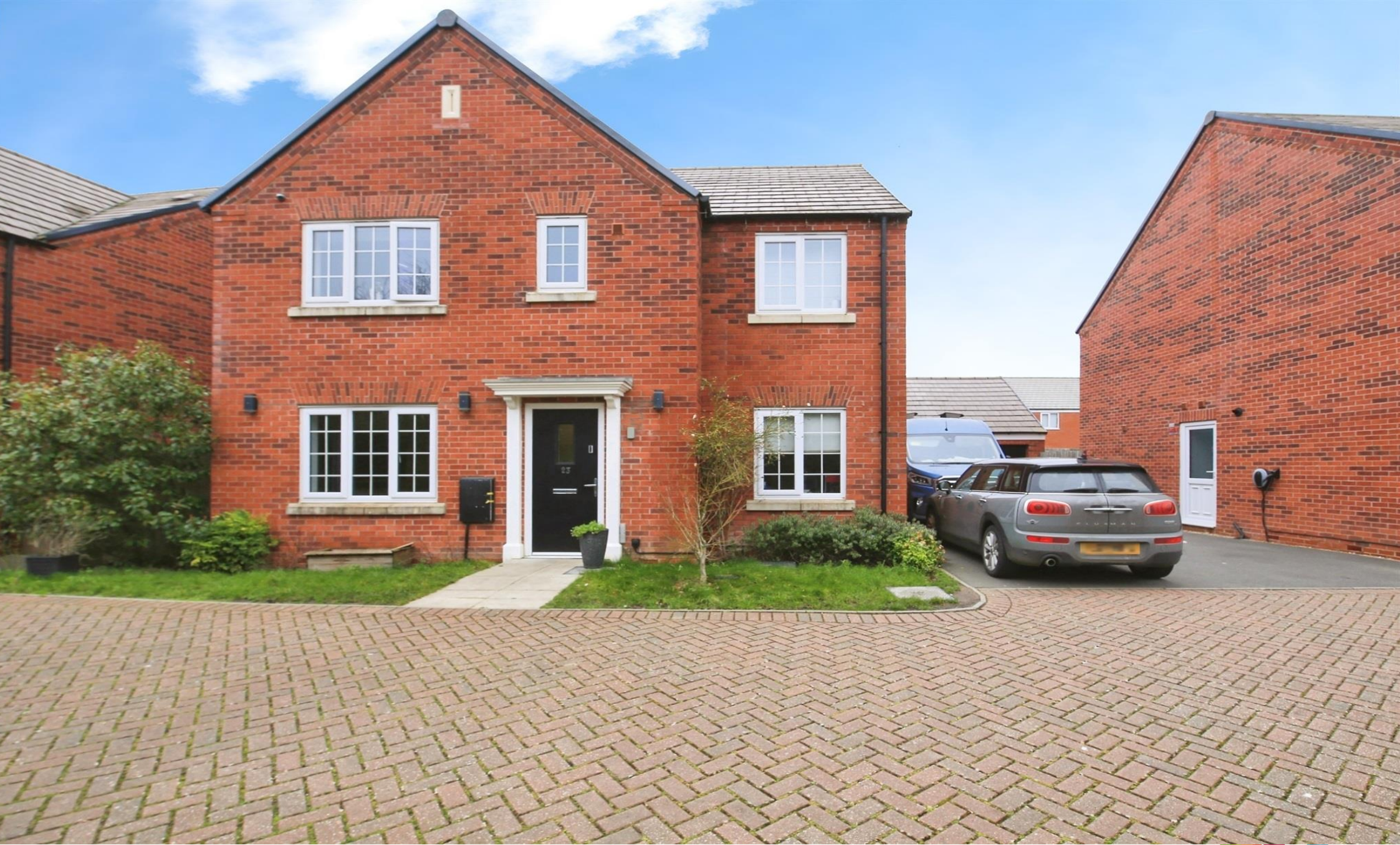
Brodie Place, Hampton Gardens, Peterborough PE7 8QD