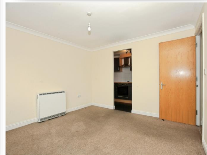
Fellowes Road, Peterborough PE2 8DS