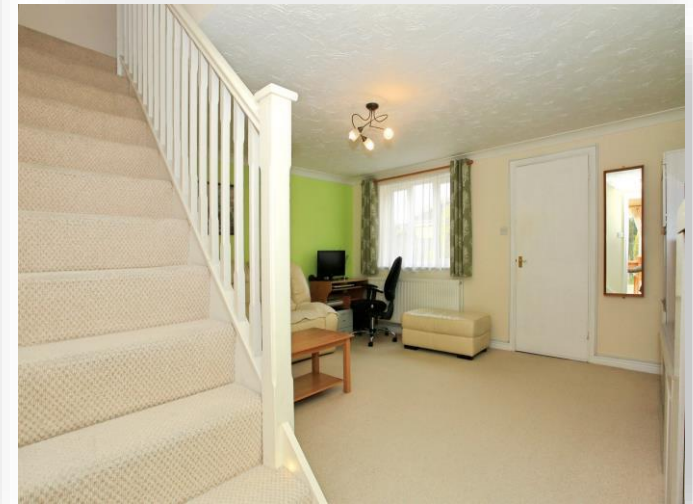
Redwing Close, Stanground Peterborough PE2 8SS