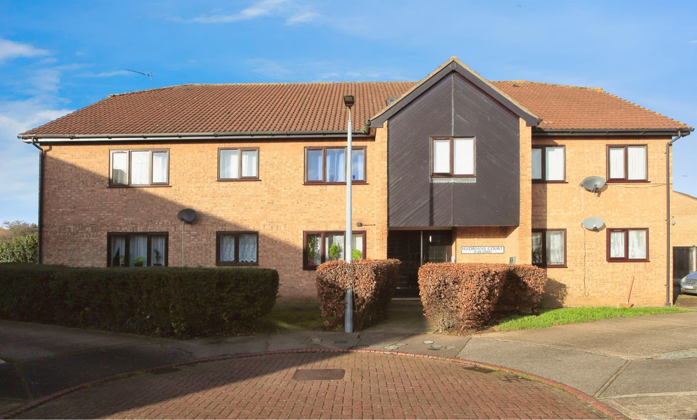
Hadrians Court, Peterborough, PE2 8NH