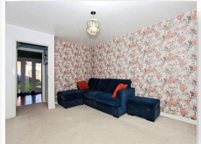
Lander Crescent, Peterborough PE7 0LZ