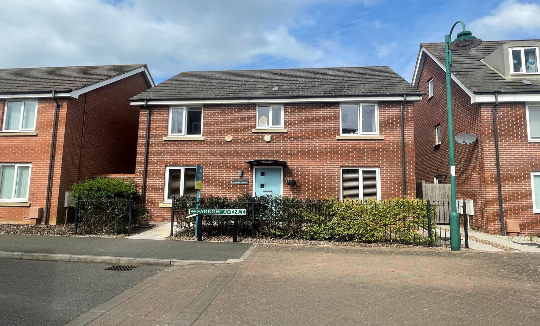
Farrow Avenue, Hampton Vale, Peterborough, PE7 8HT