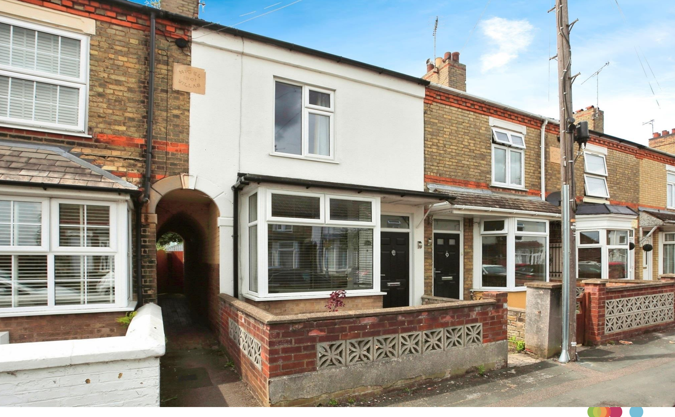
Duke Street, Peterborough, PE2 8EB