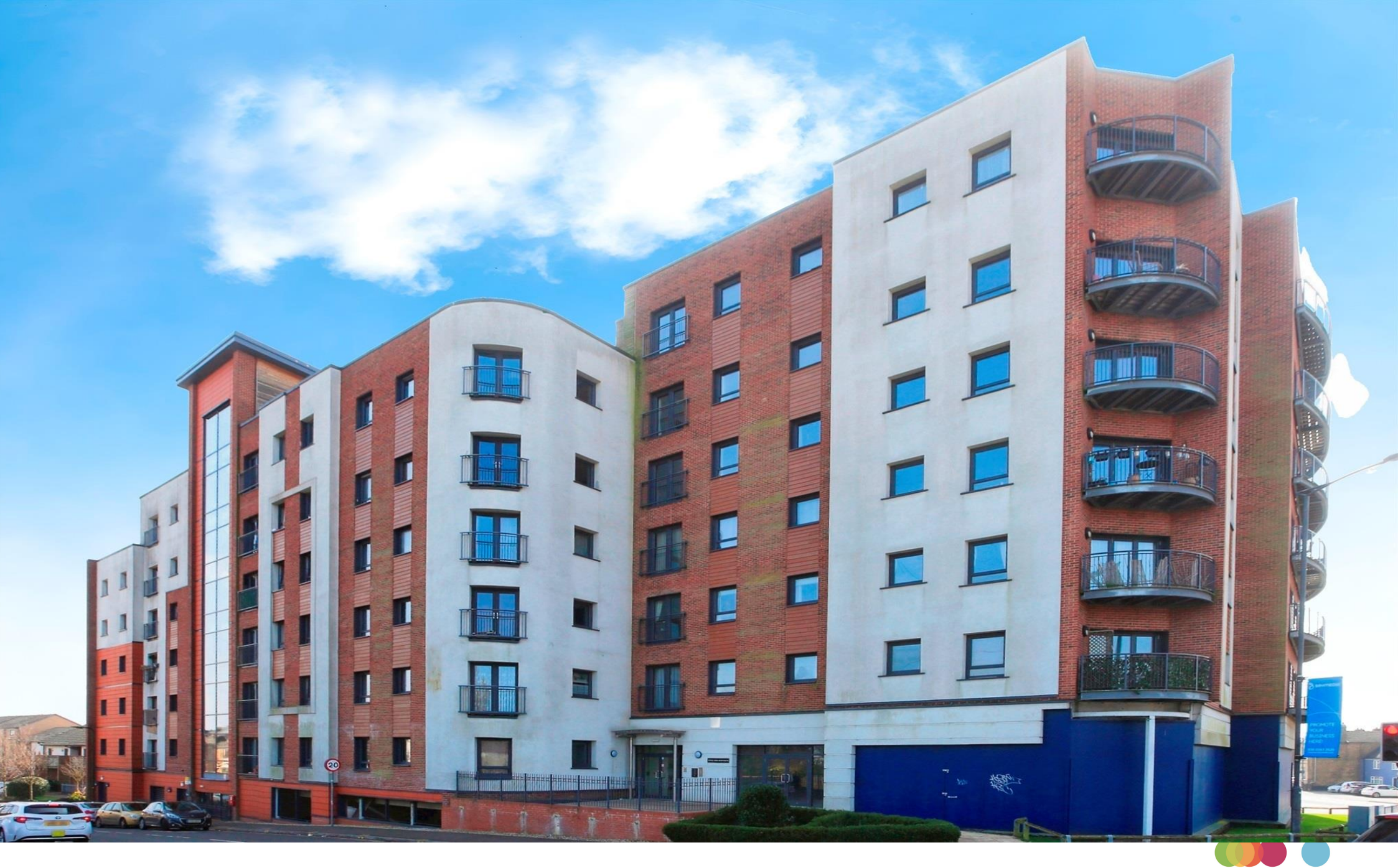
Hawksbill Way, Peterborough, PE2 8NW