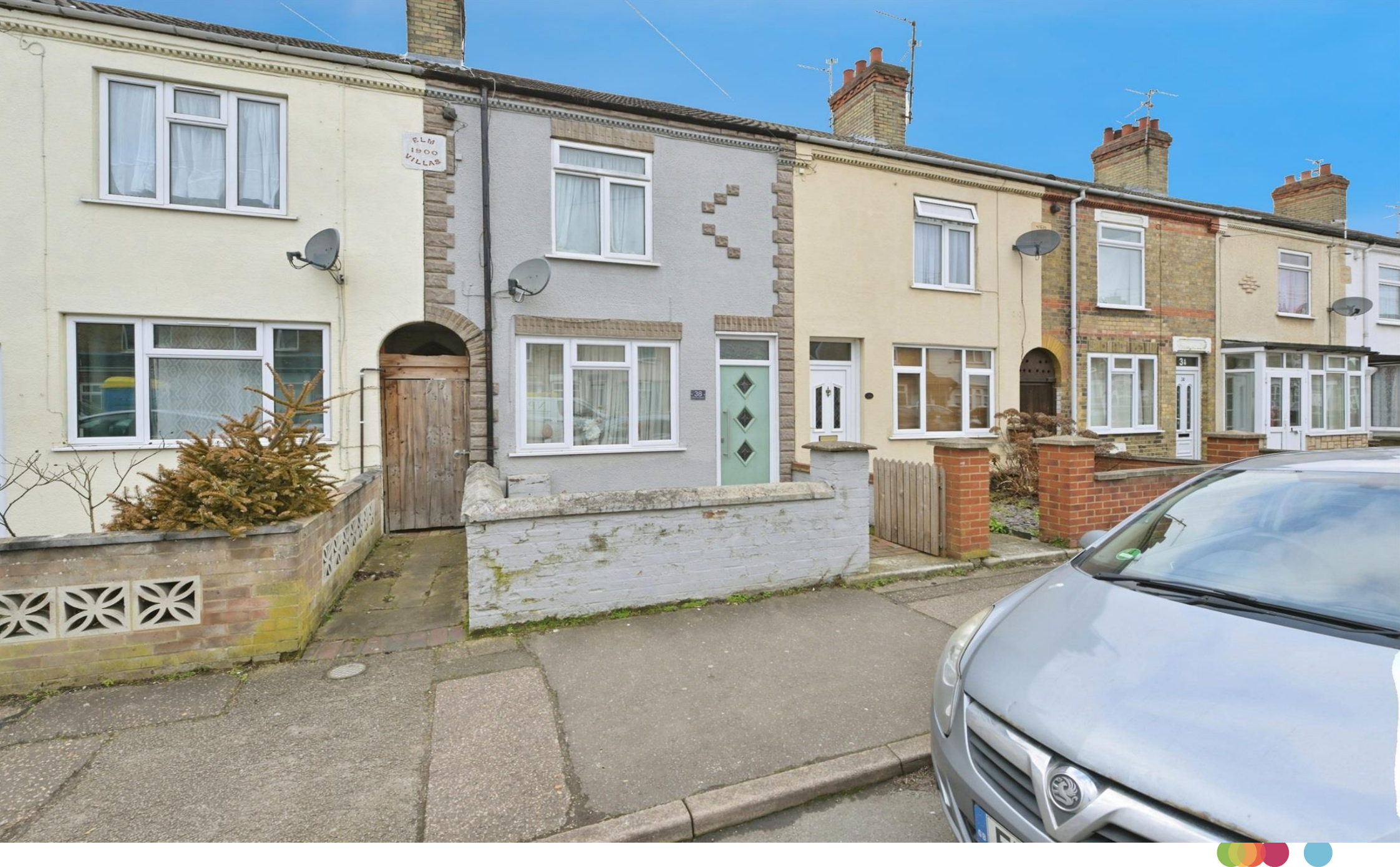
Princes Road, PETERBOROUGH, PE2 8ED