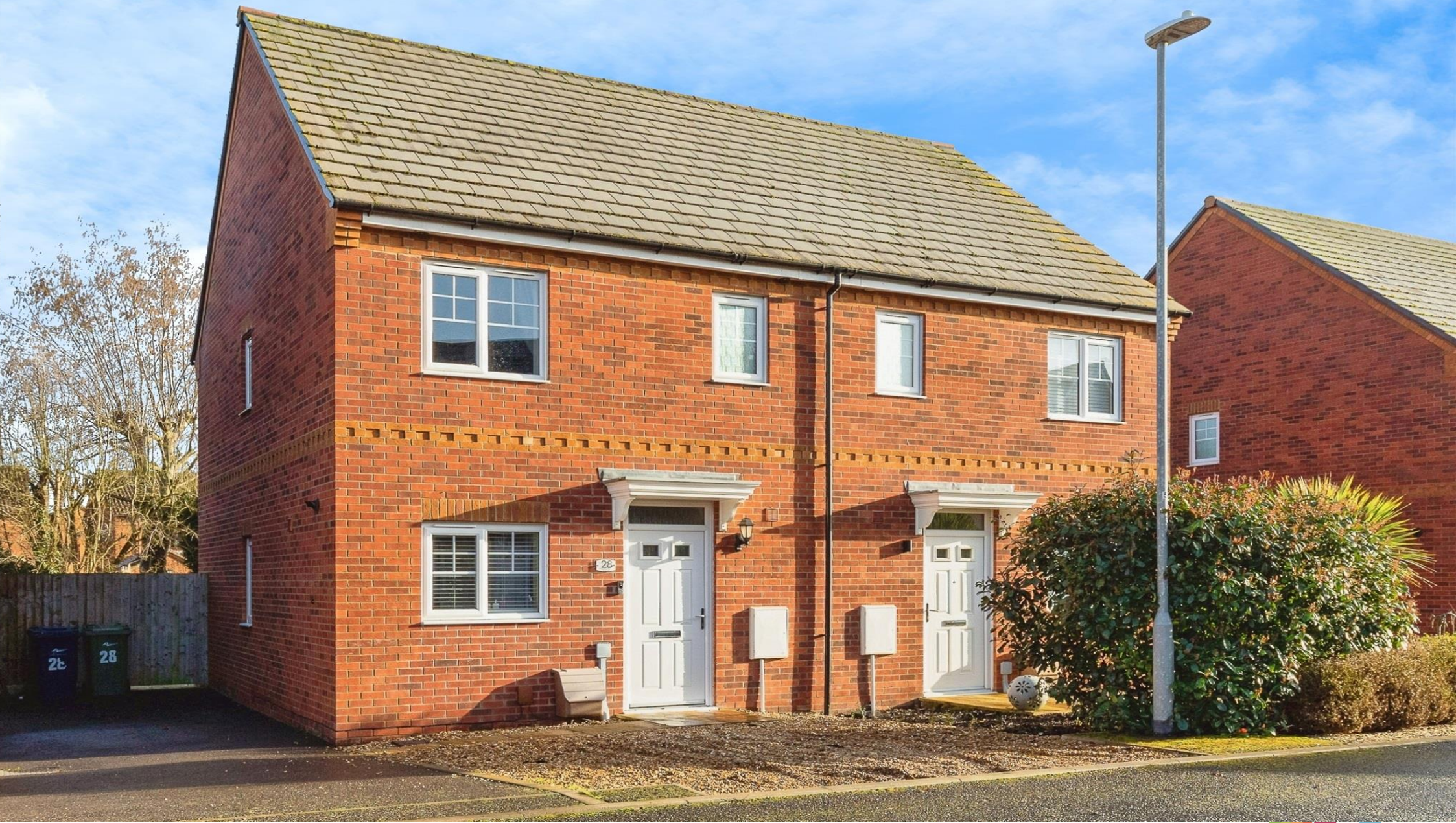
Pattens Close, Whittlesey Peterborough PE7 1FA