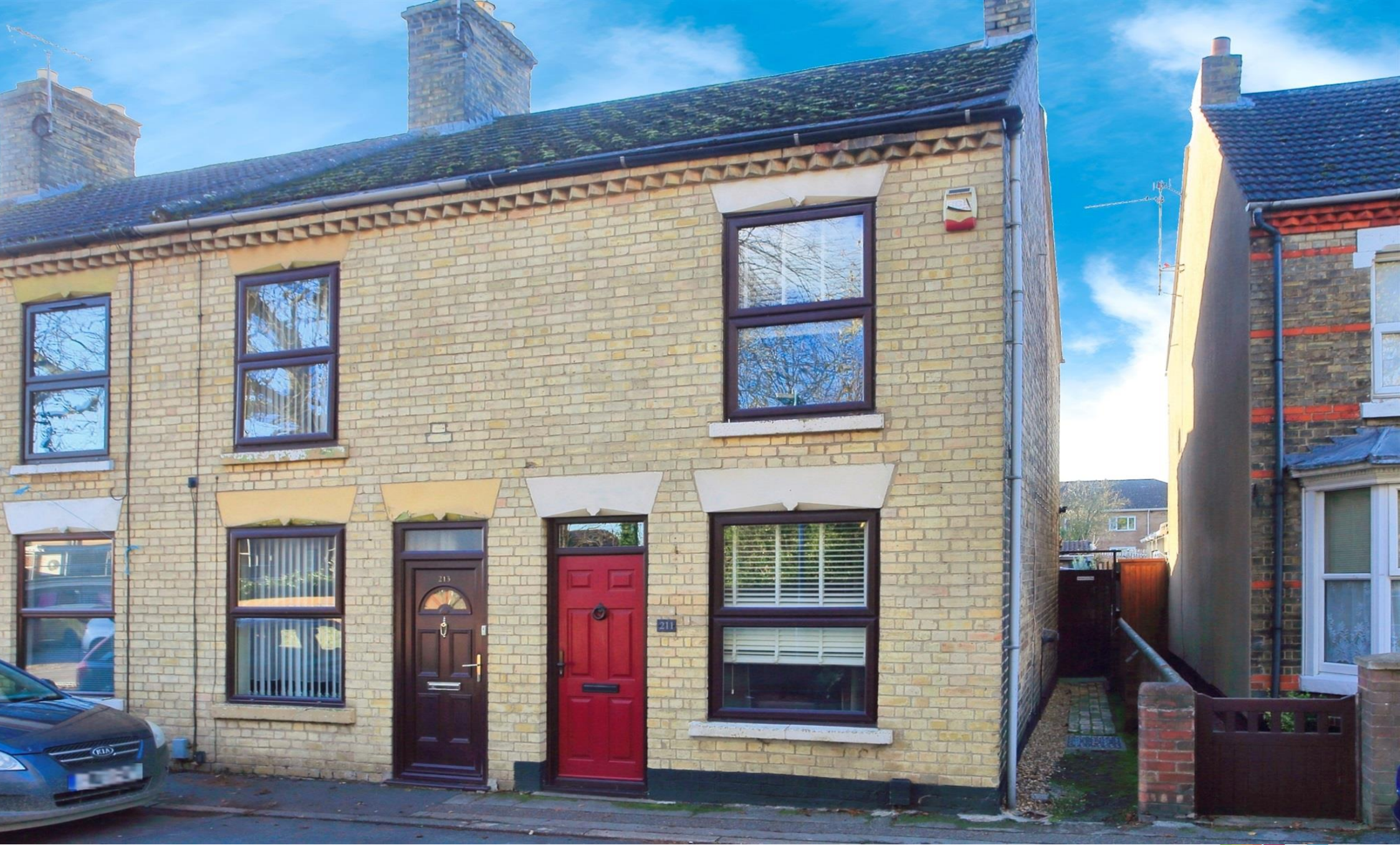
Fletton Avenue, Peterborough PE2 8DE