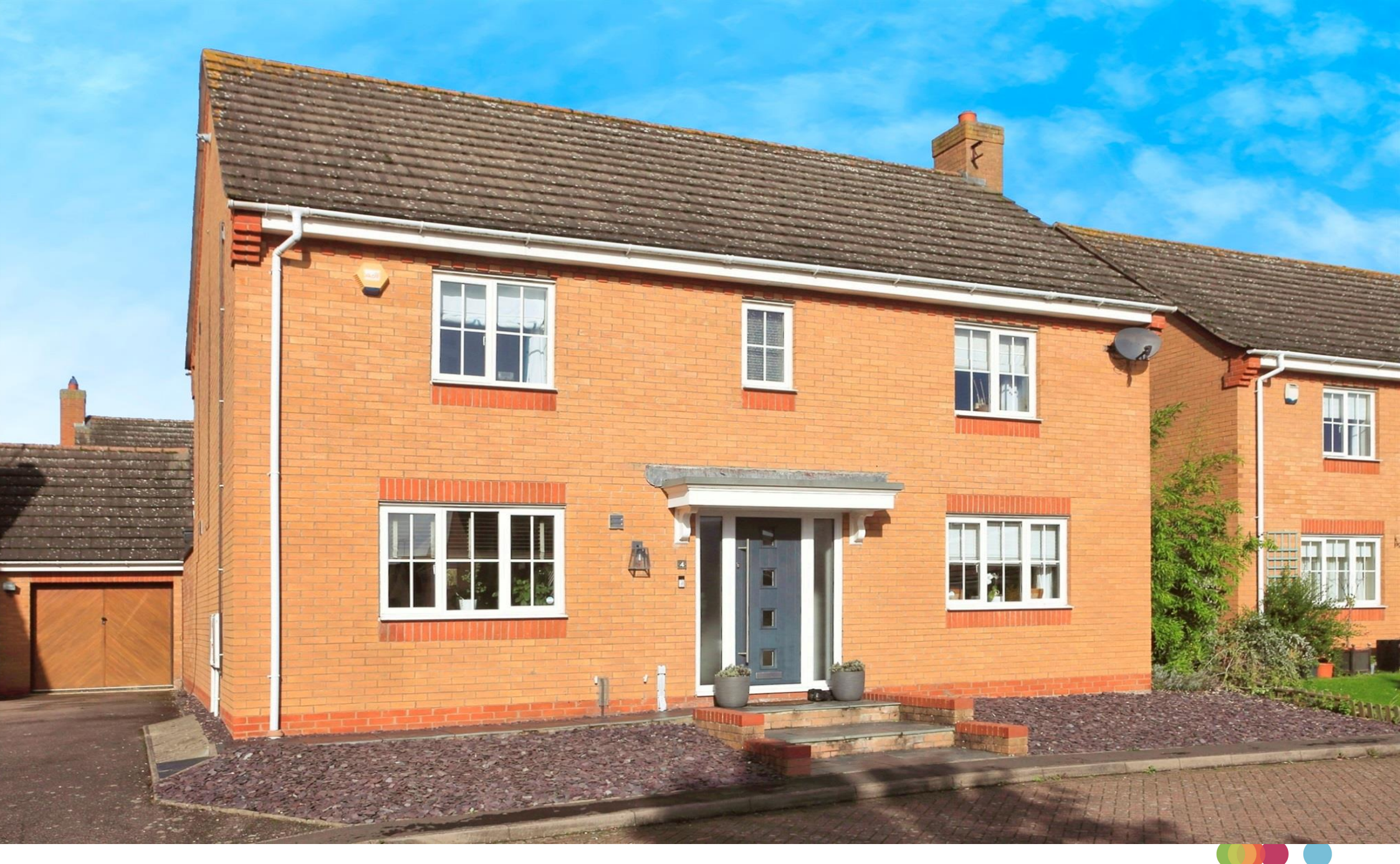
Appleton Close, Hampton Hargate Peterborough PE7 8BN