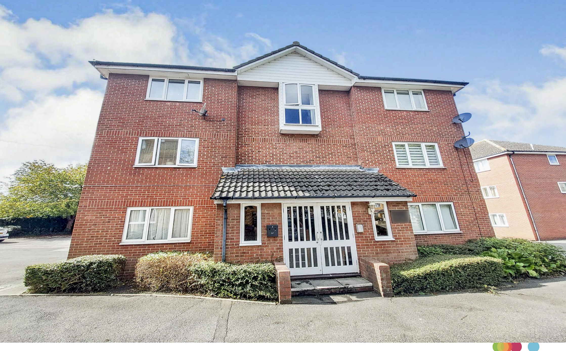
Flamborough Close, Woodston, Peterborough, PE2 9LP