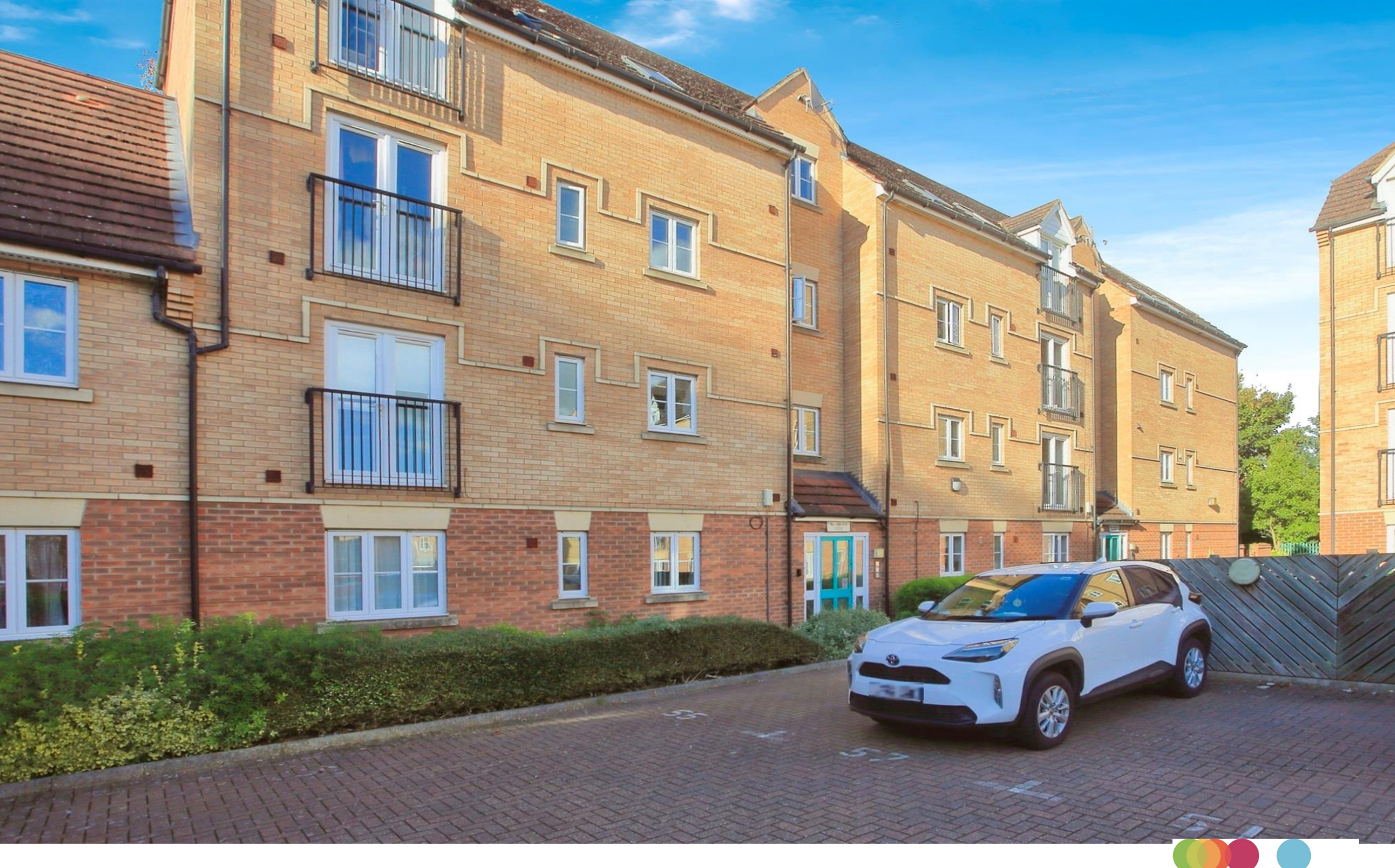
Regal Place, Peterborough PE2 9AP