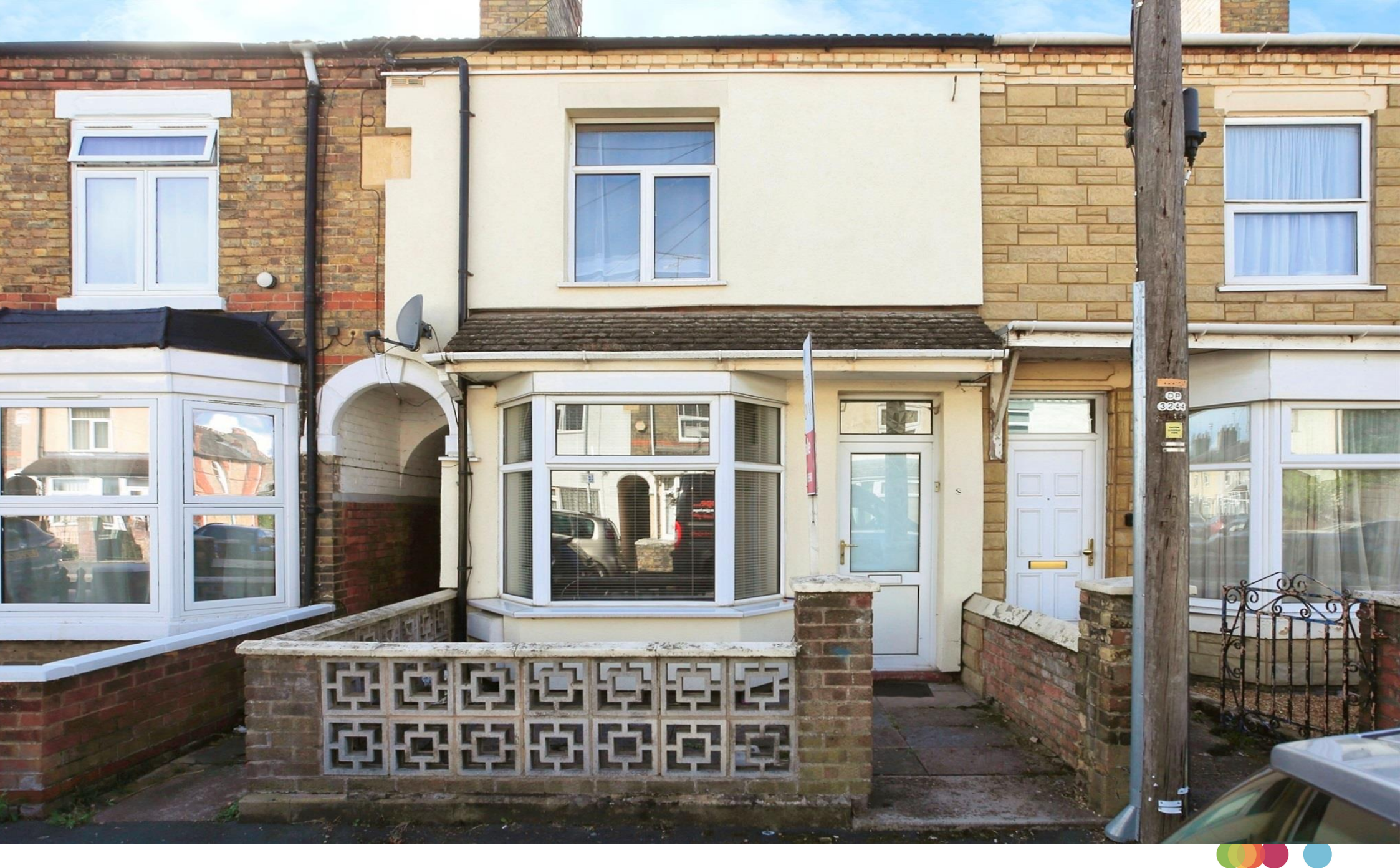
Duke Street, Peterborough PE2 8EB