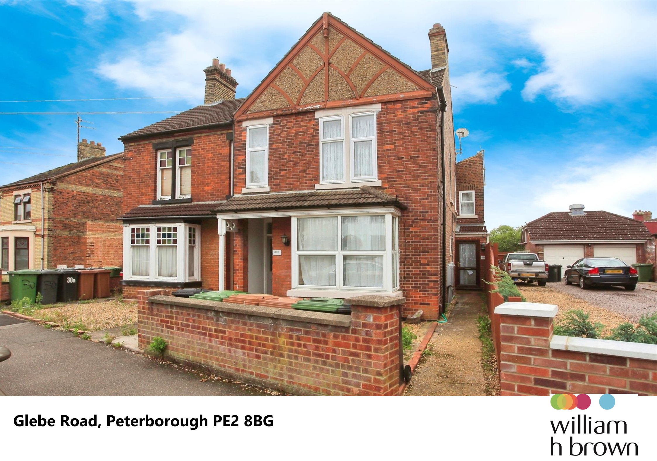
Glebe Road, Peterborough PE2 8BG