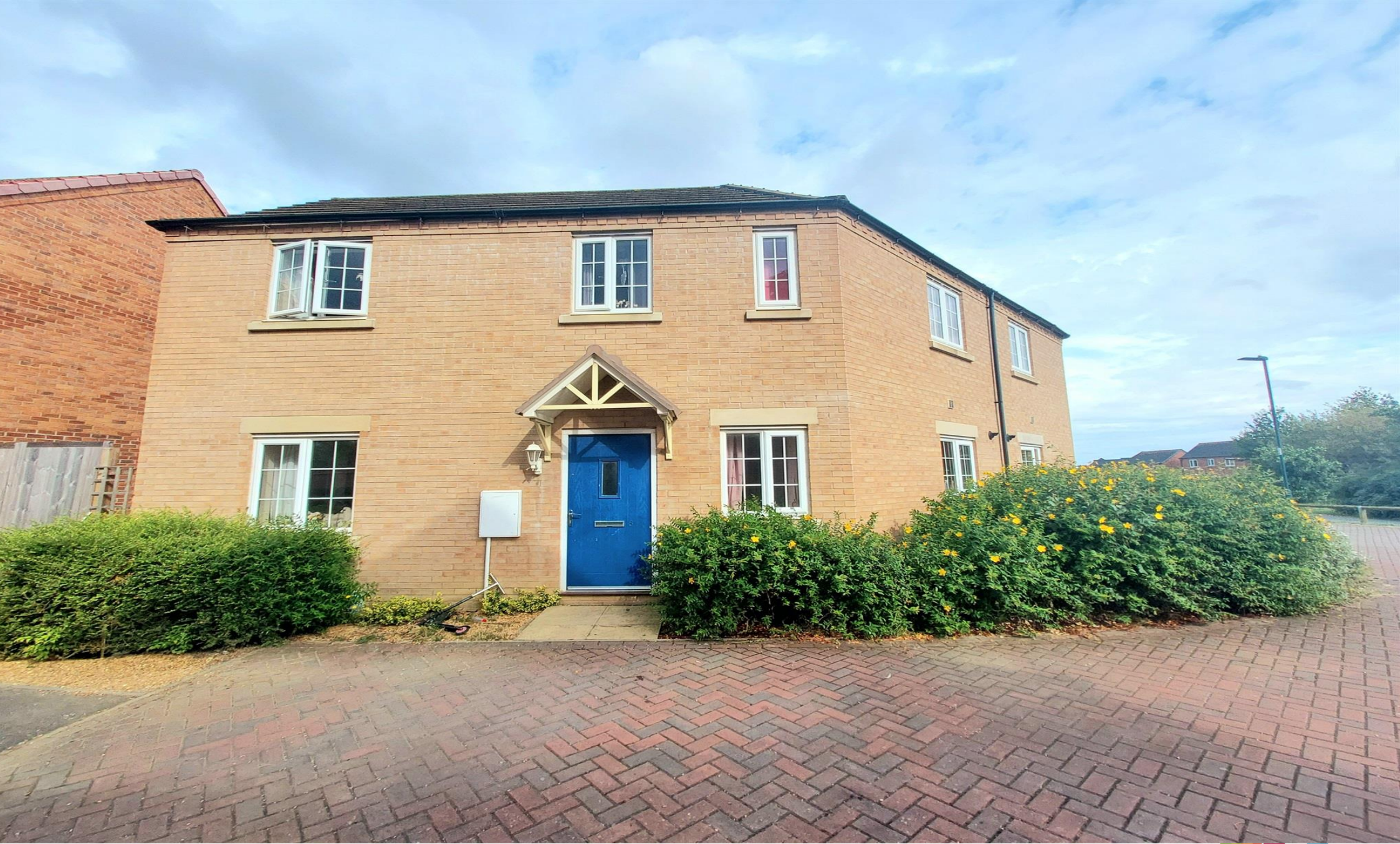
Magnus Close, Peterborough PE2 8SF