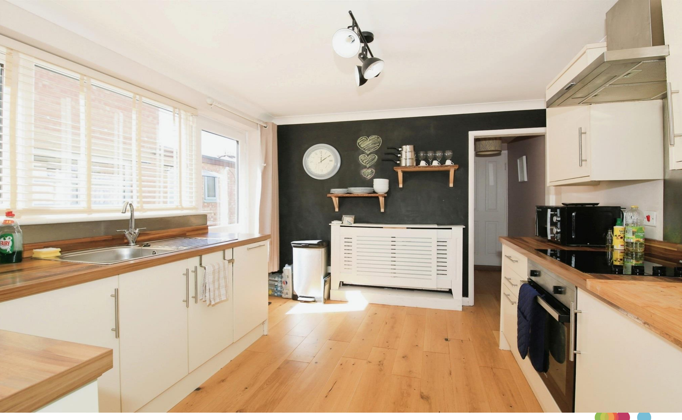
Hallcroft Road, Whittlesey, Peterborough, PE7 1LP