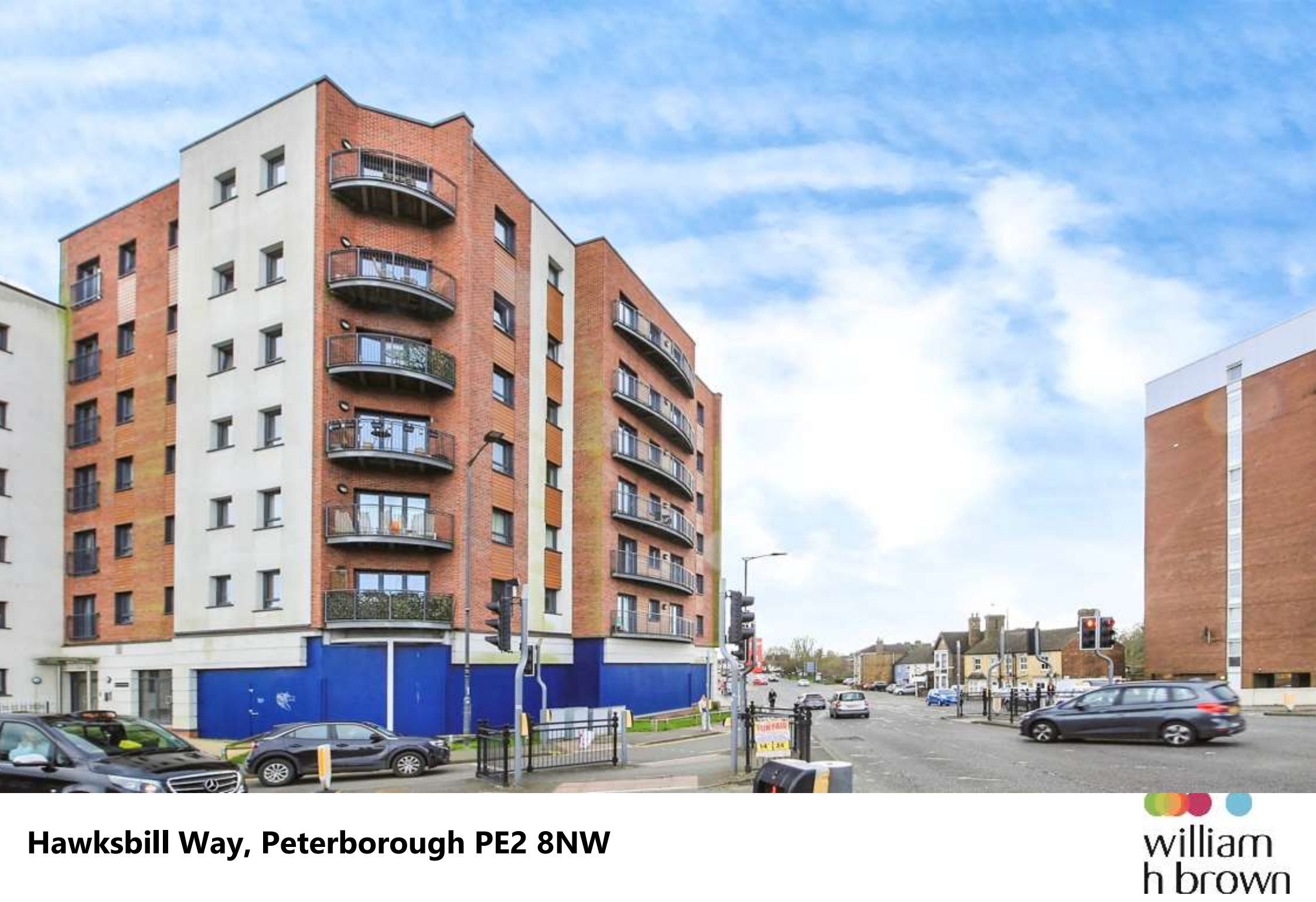
Hawksbill Way, Peterborough PE2 8NW