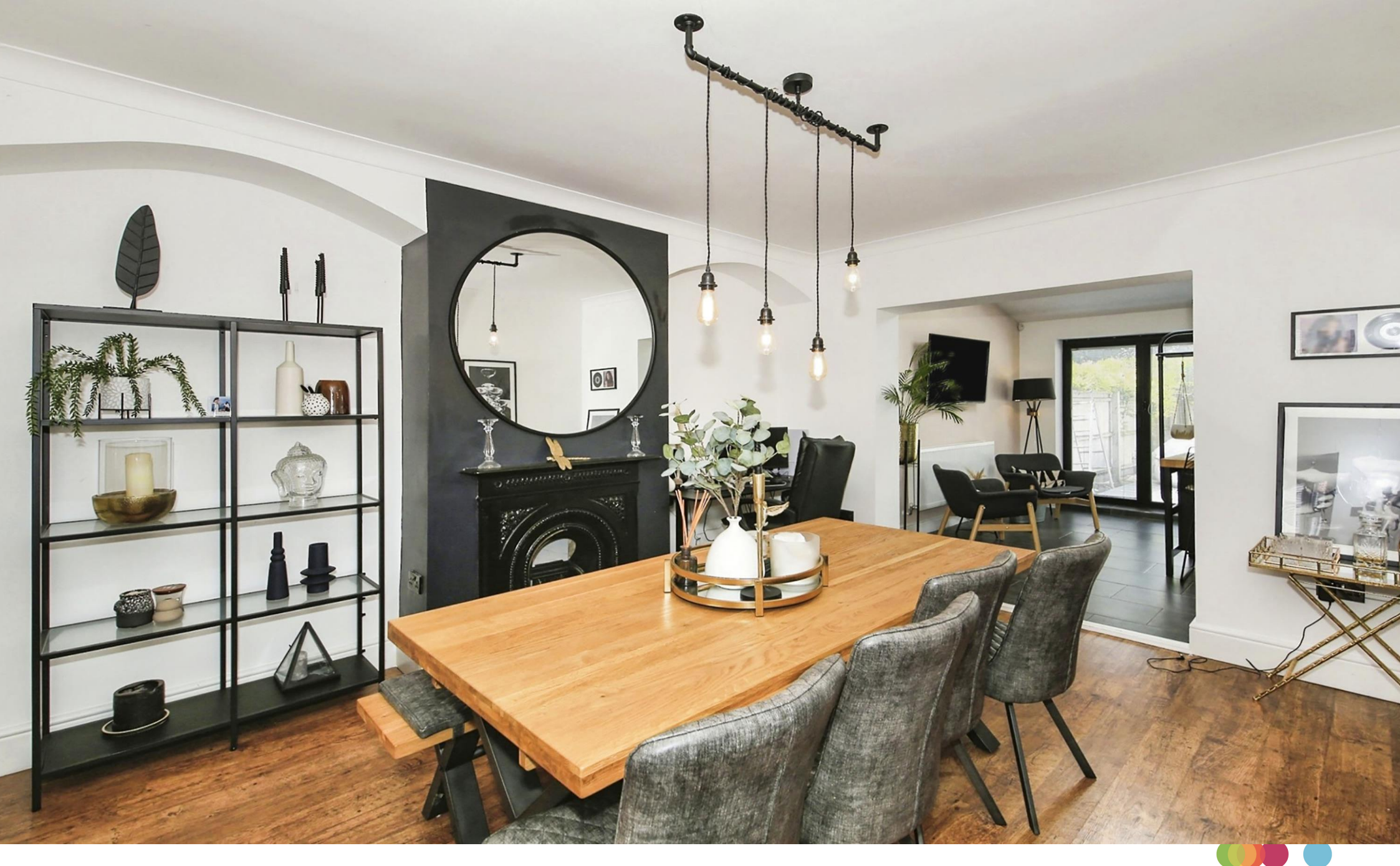
Fairfield Road, Peterborough PE2 8BD