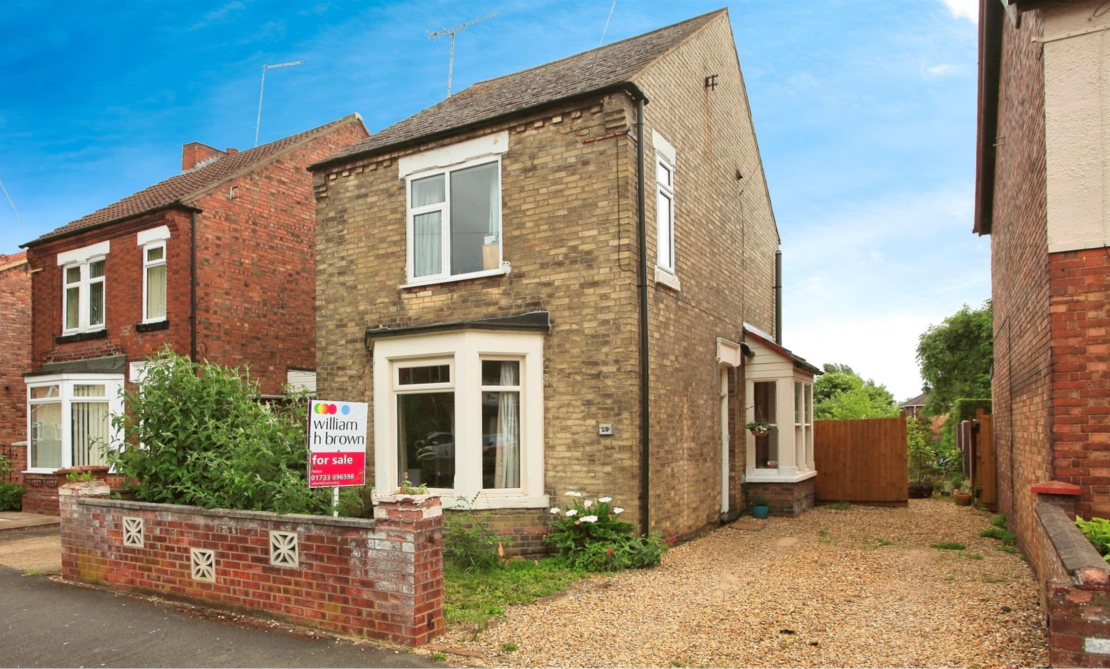
Fairfield Road, Peterborough, PE2 8BD