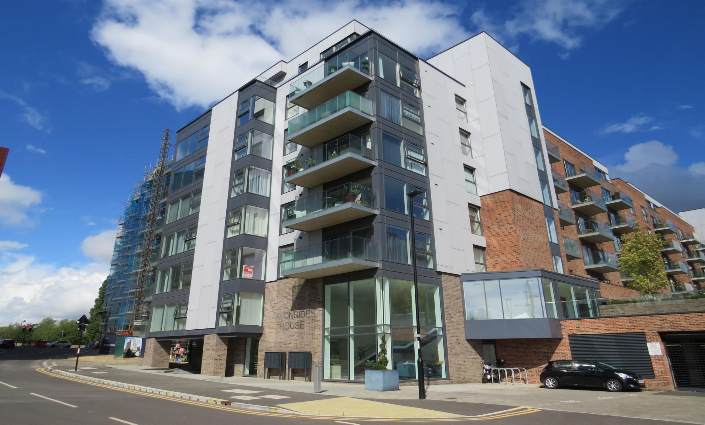
Avonside House East Station Road, Fletton Quays Peterborough PE2 8UA