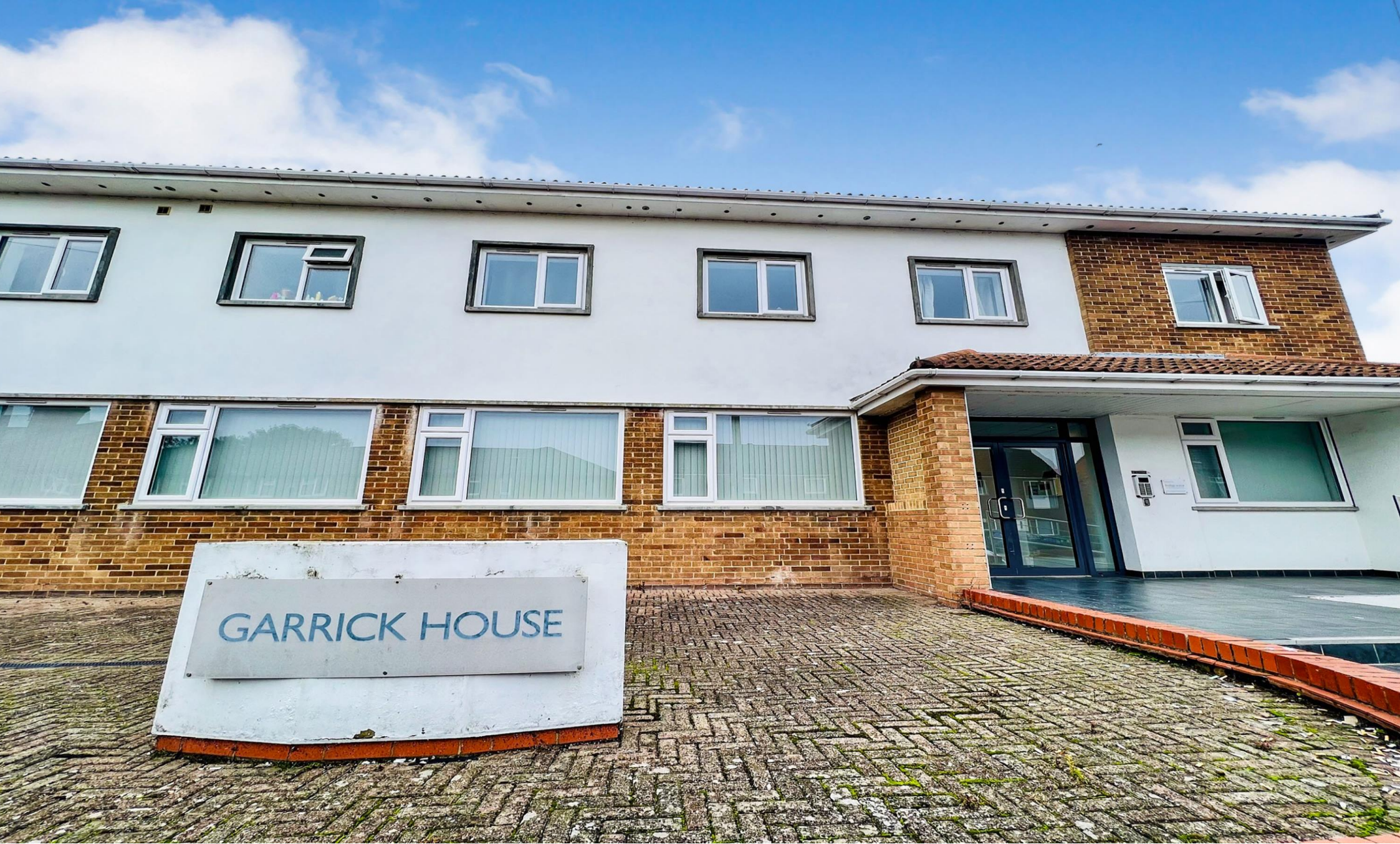
Garrick House High Street, Peterborough PE2 8DR