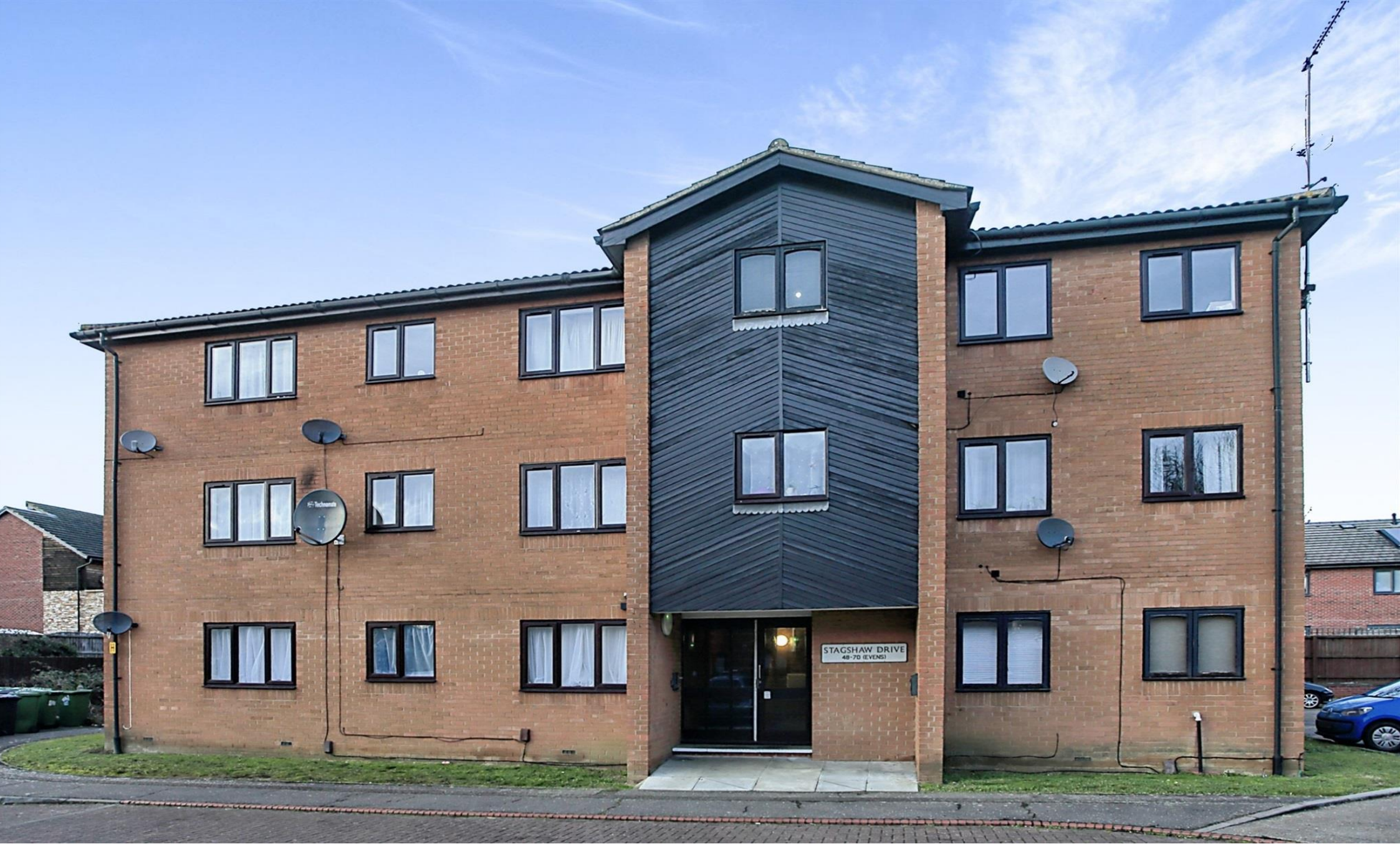
Stagshaw Drive, Peterborough PE2 8NQ