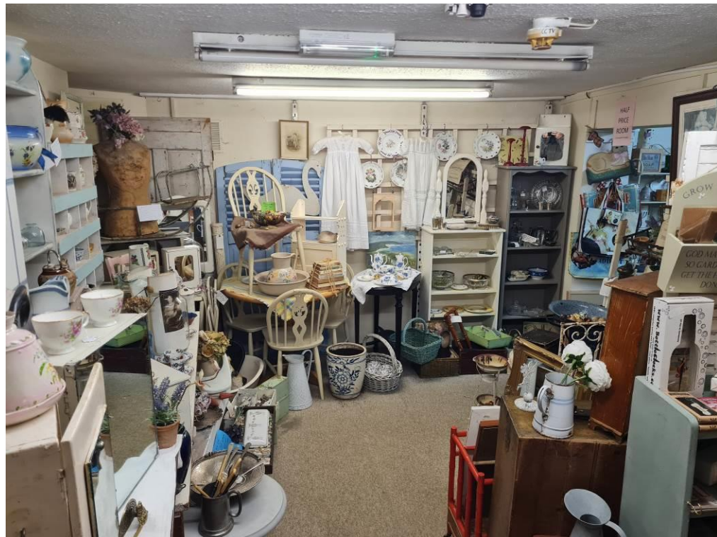
Lower Sale Floor front room

07915 668232 | AGS@STIBBARDPROPERTY.CO.UK STIBBARDPROPERTY.CO.UK