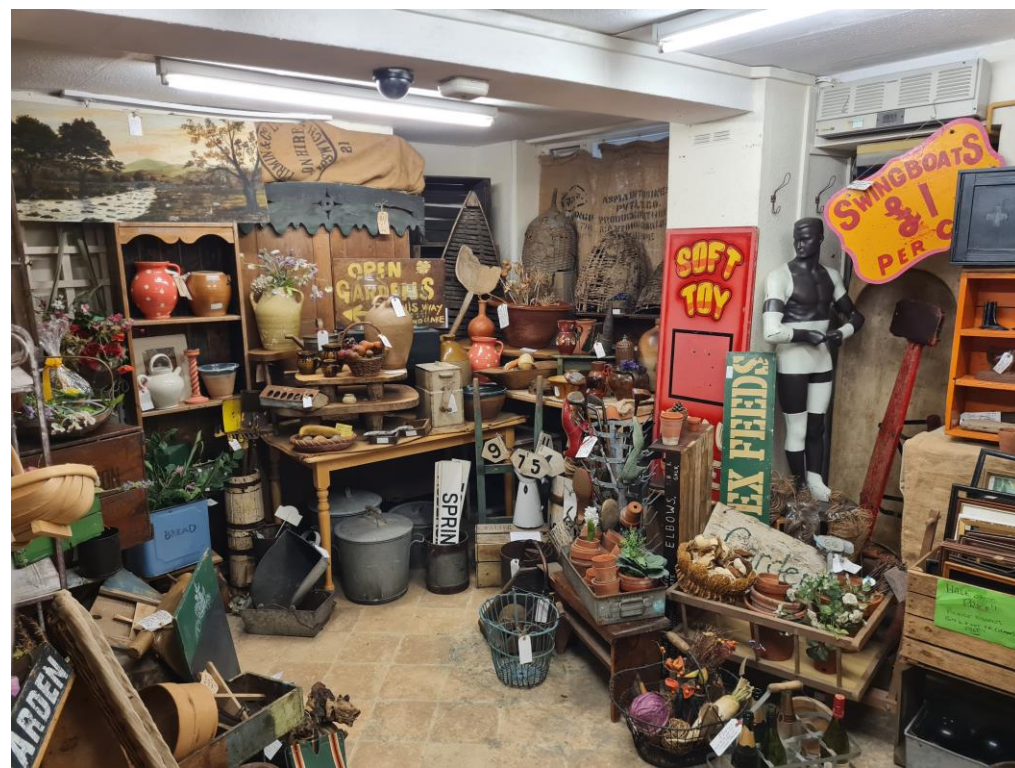
Lower Sale Floor rear room