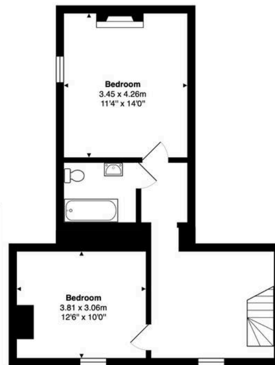
Second Floor Area: 47.1 m 2 ... 507 ft 2