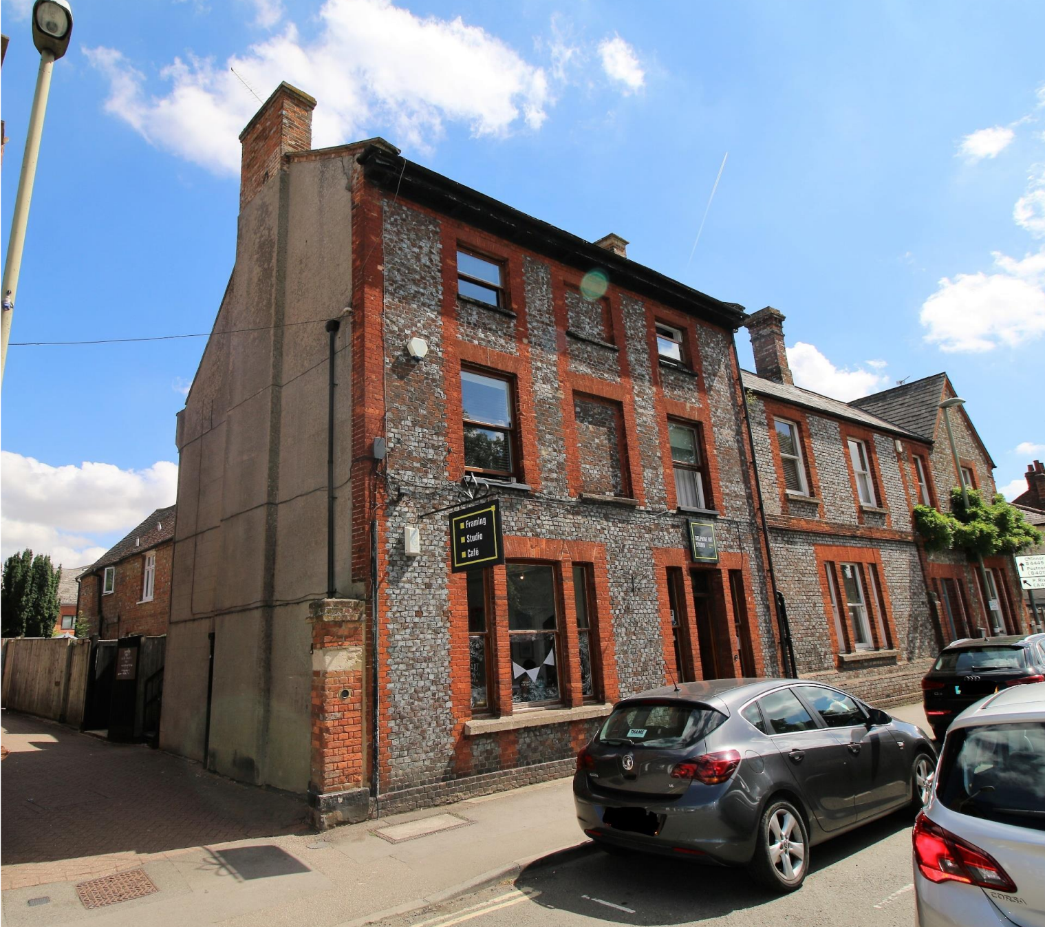
Upper High Street THAME