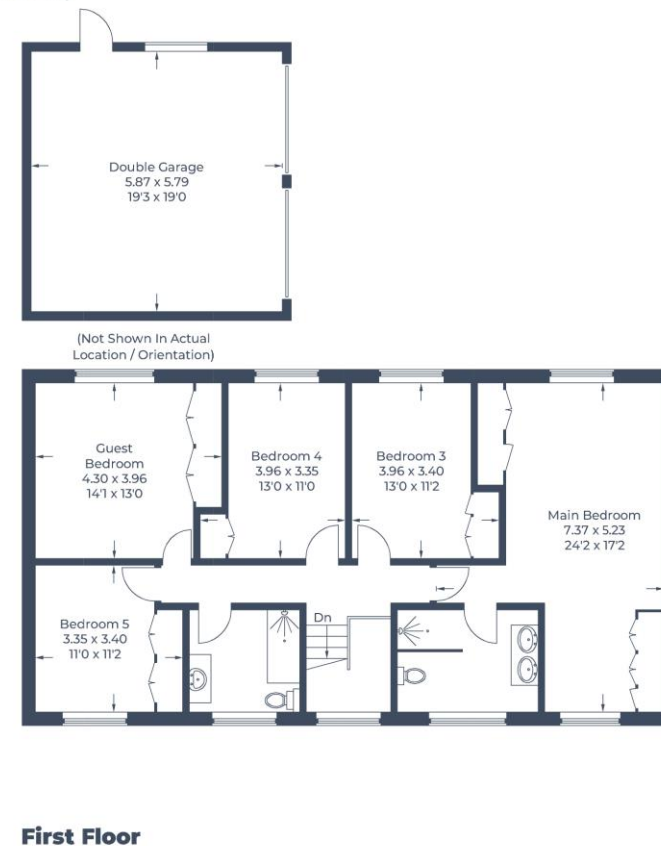
Illustration for identification purposes only, measurements are approximate, not to scale. © CJ Property Marketing Produced for Colombbs