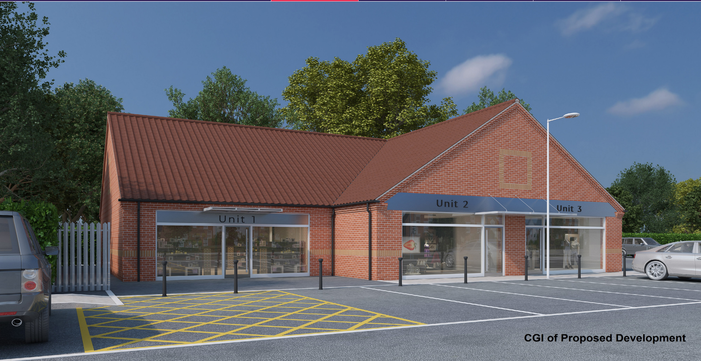
CGI of Proposed Development

Former Co-op Foodstore, High Street, Collingham, Newark, NG23 7LB