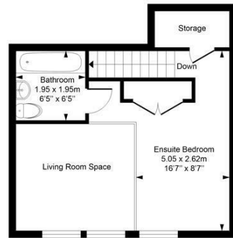
Second Floor (Mezzanine)