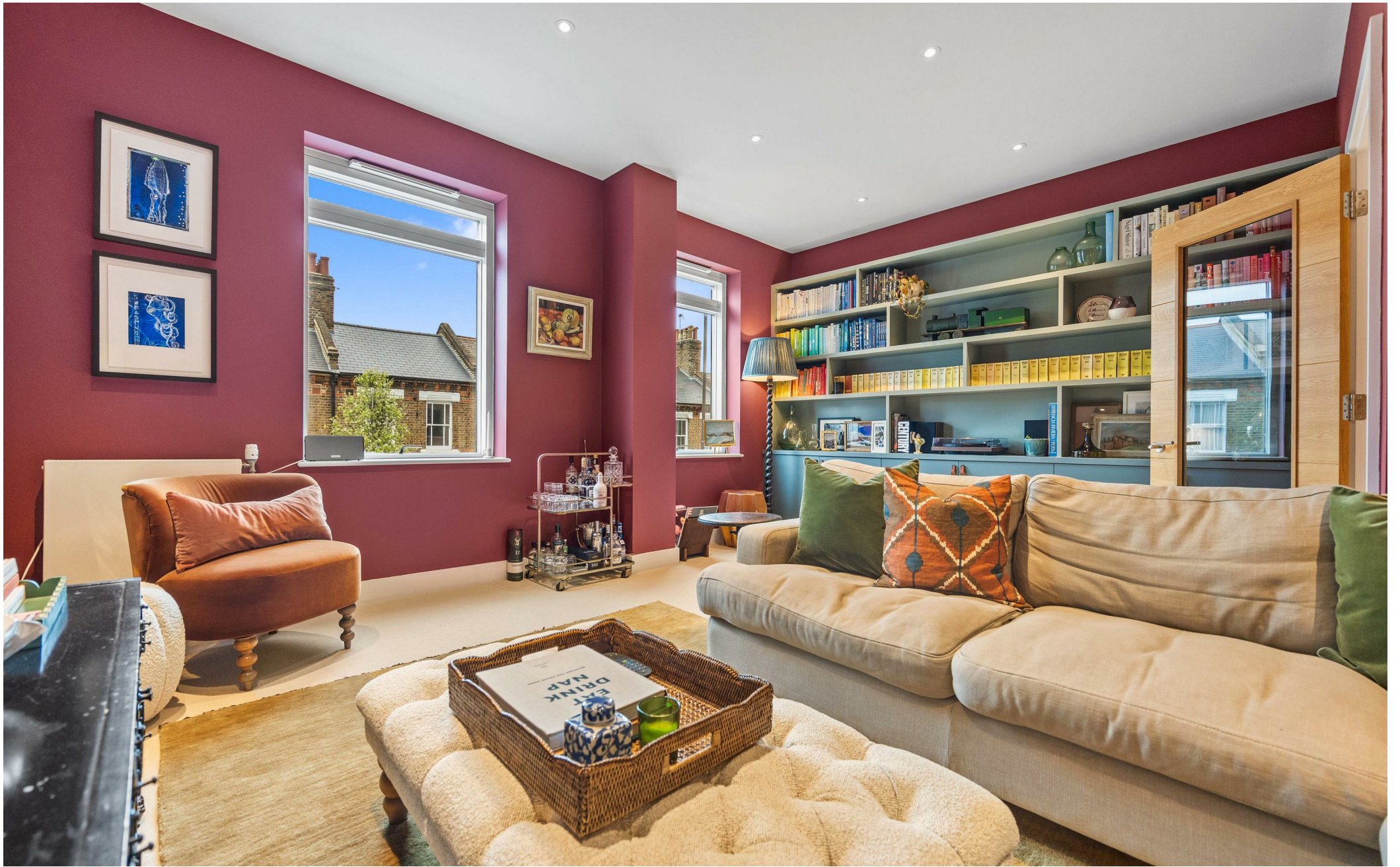
Dermot Terrace, Kilburn Lane W10