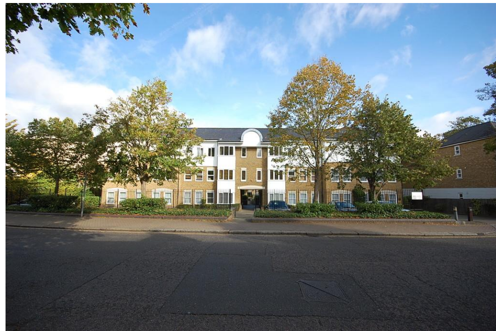
Whilst we endeavour to make our sales particulars fair, accurate and reliable, they are only intended as a general guide to the property. Measurements and distances are approximate. These particulars do not form part of any offer or contract. If there are important matters that are likely to affect your decision to buy, please contact us before viewing the property. Please note that we have not tested the services, equipment or appliances in this property, accordingly, we advise prospective buyers to commission their own survey or service reports before finalising any offer to purchase.