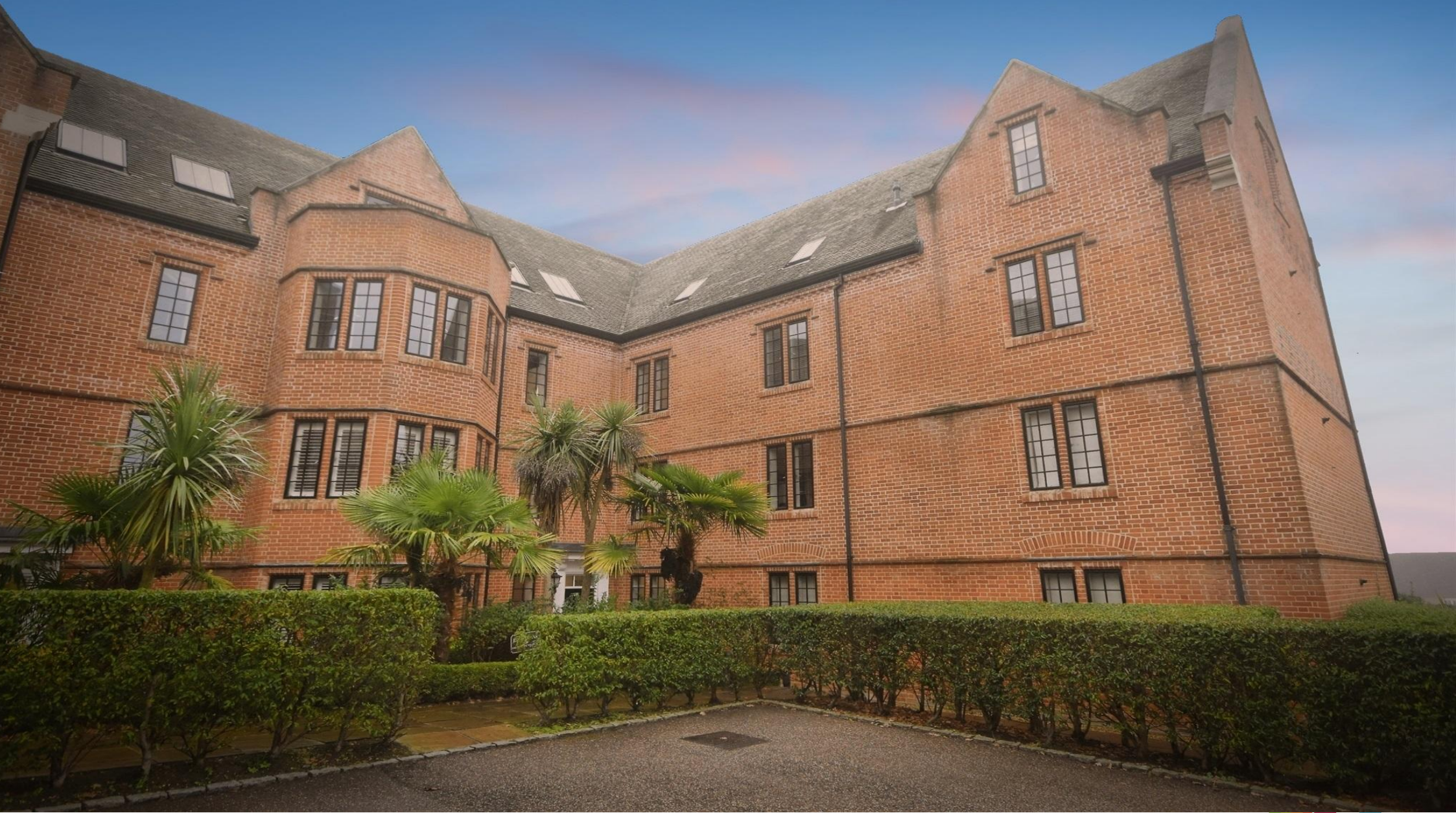
Rose Court, The Galleries, Warley, Brentwood, CM14 5GJ