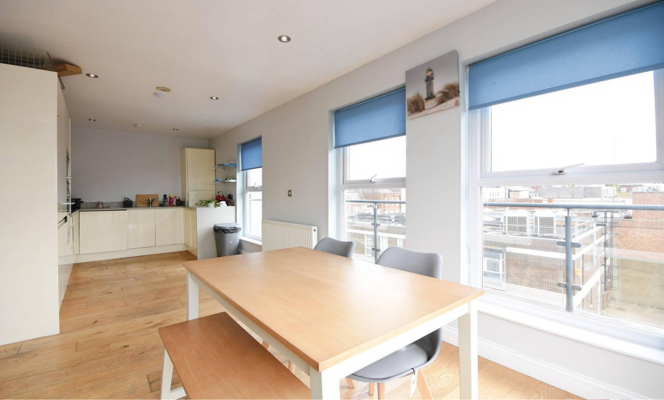
Crown House, Crown Street, Brentwood, CM14 4AZ