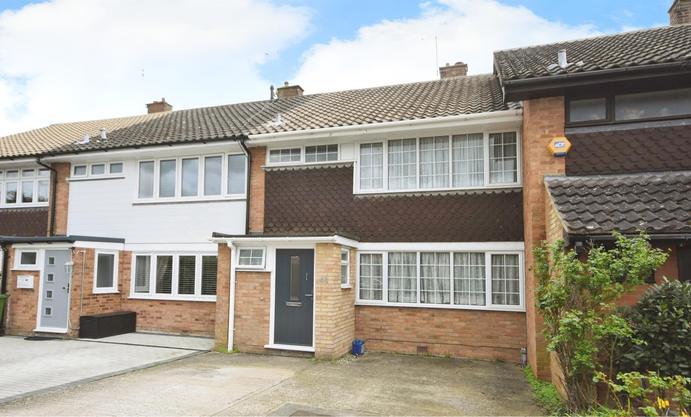
The Furlongs, Ingatestone, CM4 0AJ