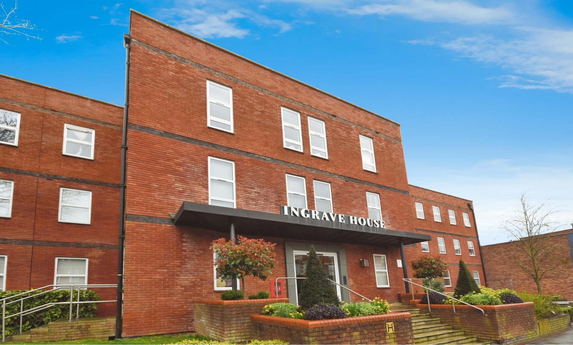
Ingrave House, Ingrave Road, Brentwood, CM15 8TG