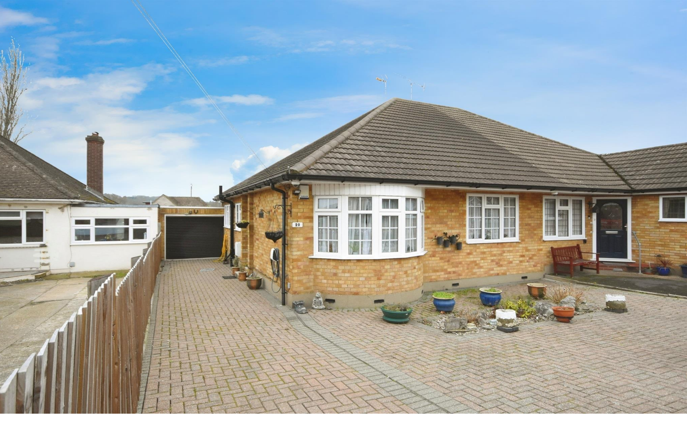
Westbourne Drive, Brentwood, CM14 4PH