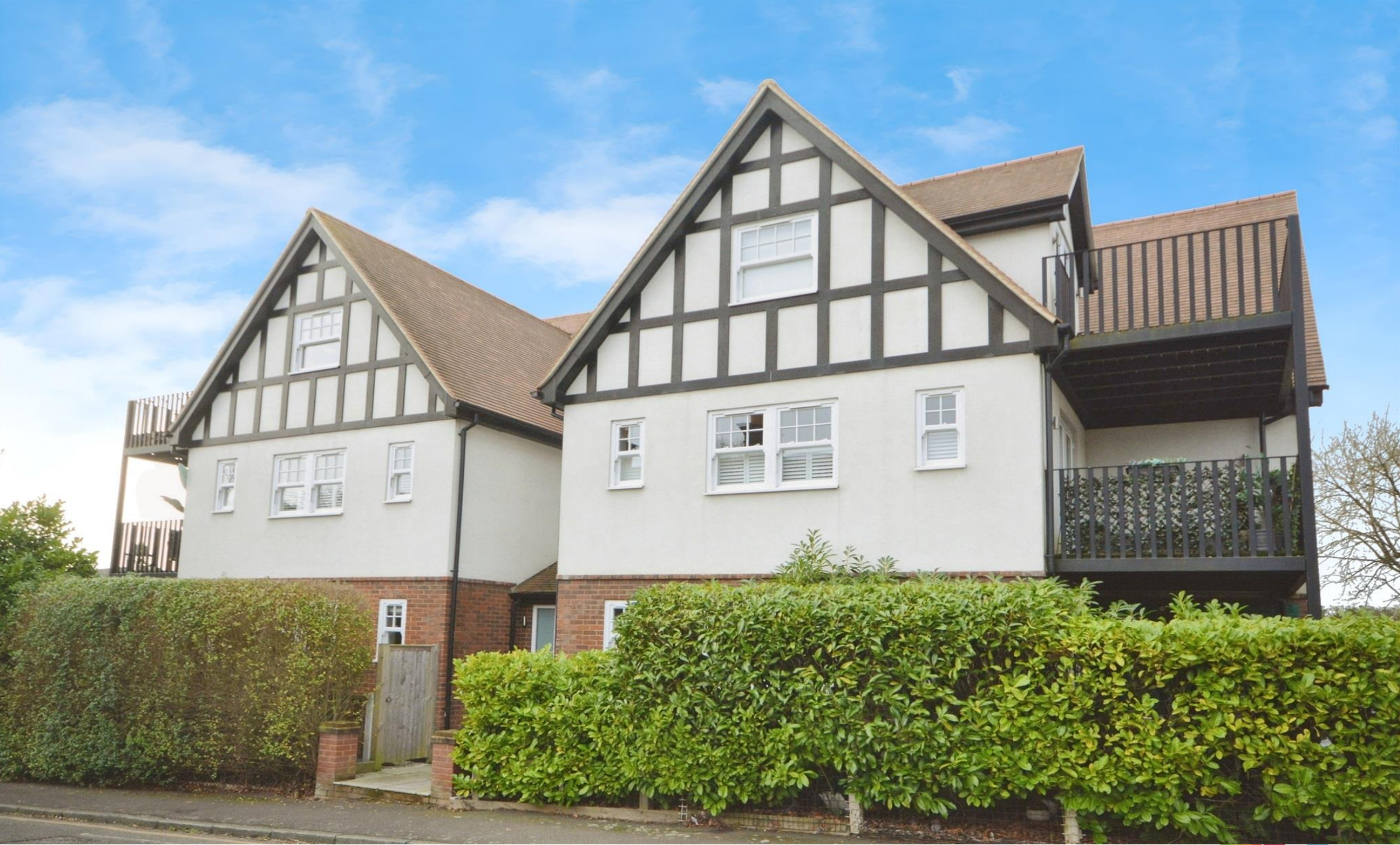
Westbury View, Westbury Road, Brentwood, CM14 4JS