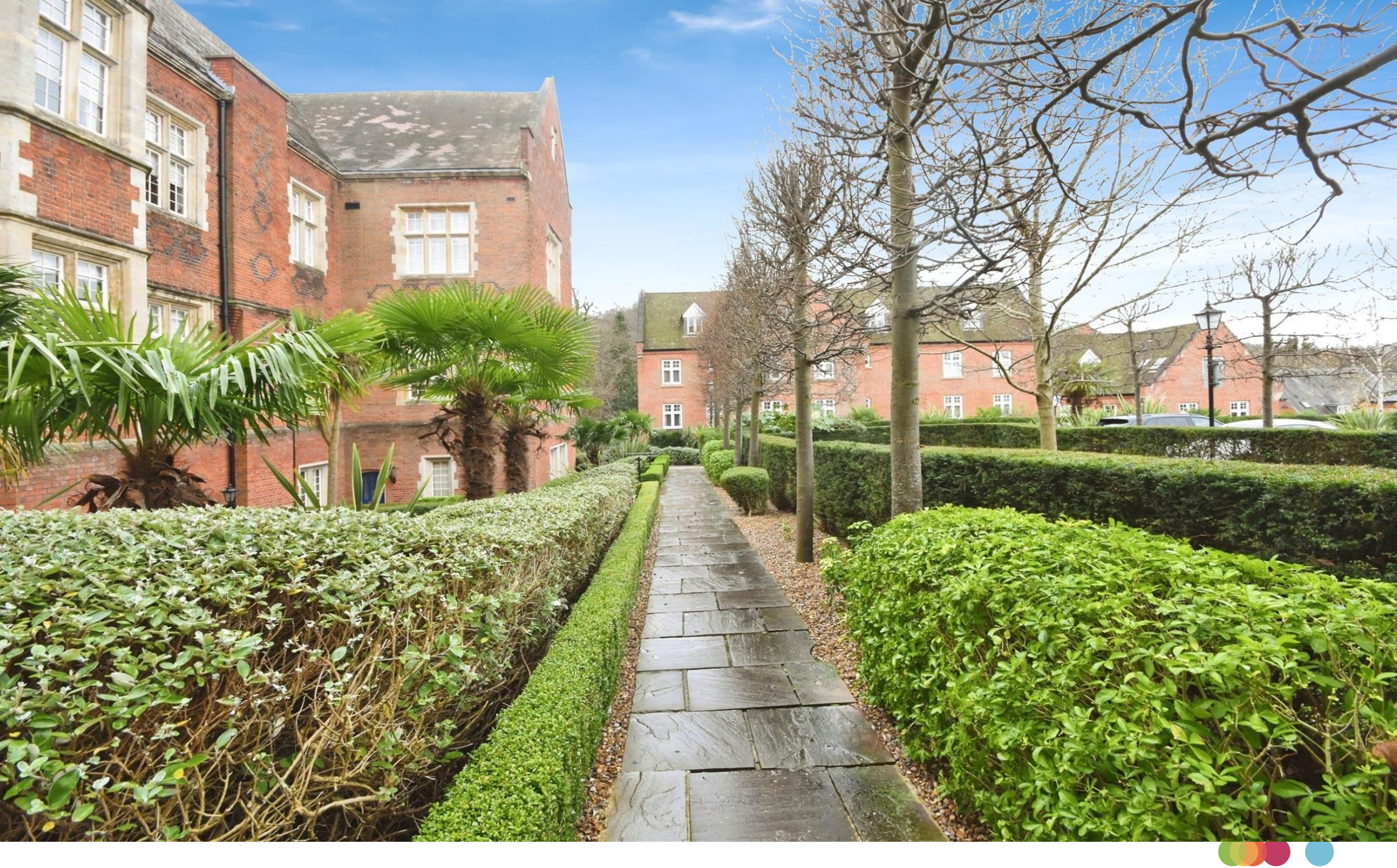
Kendall Court, The Galleries, Warley, Brentwood, CM14 5FN