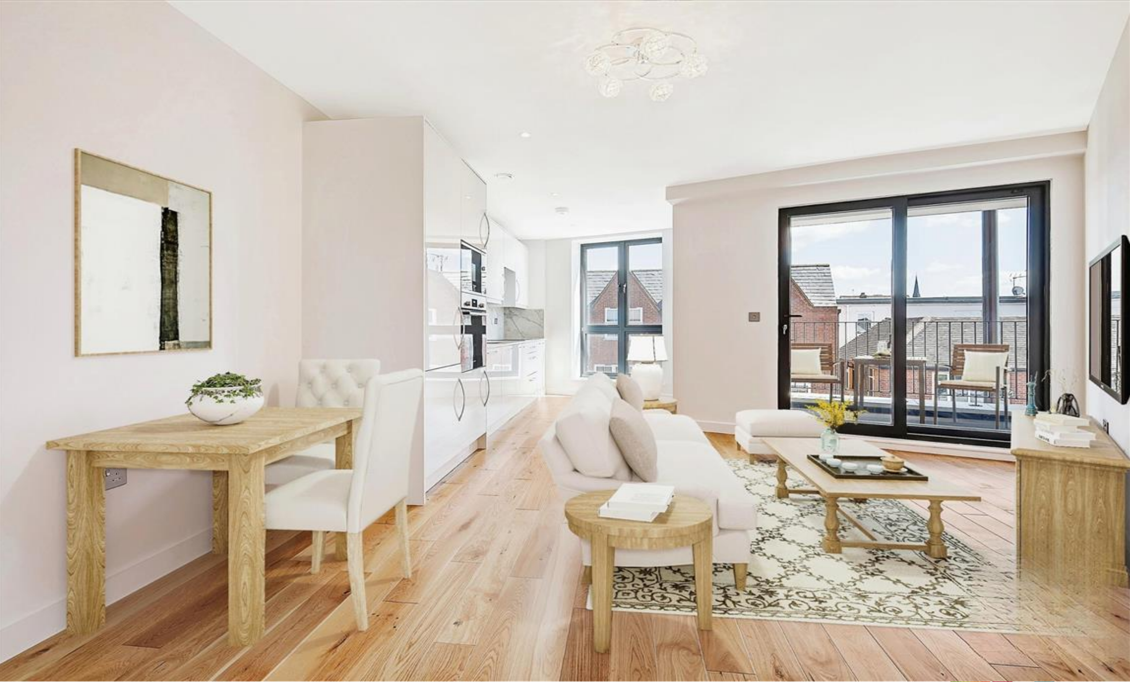
Umiya House, Brentwood CM14 4SA