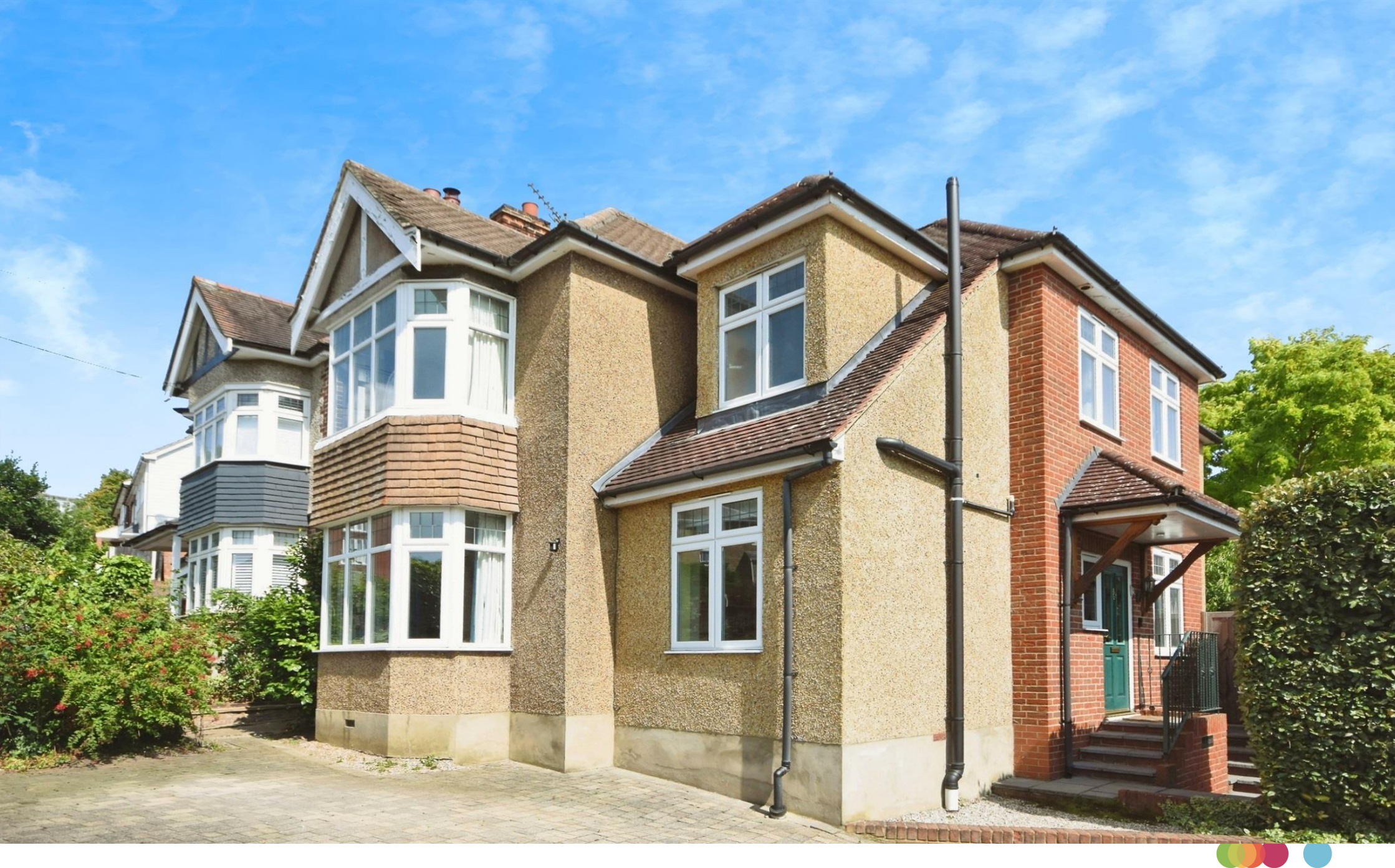
Fairbourne, The Close, Brentwood, CM14 4JA