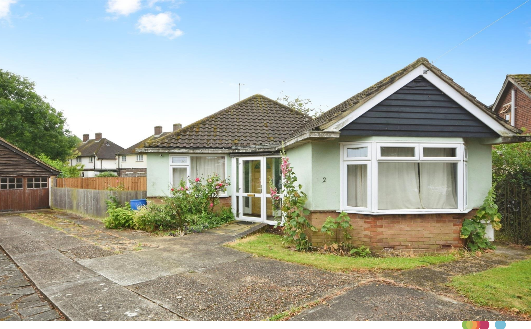
Priory Close, Pilgrims Hatch, Brentwood, CM15 9PZ